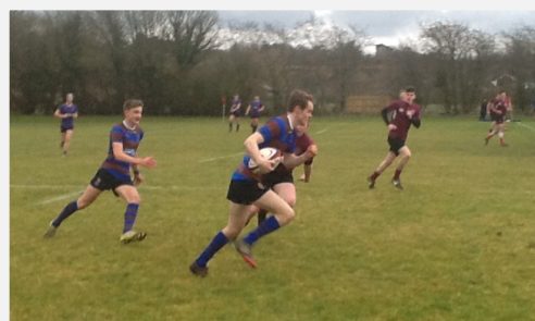
Pictured: U18 Schools sevens at Yarm School

A number of schools took place in the seven's events with schools entering that would not normally which was fantastic to see!